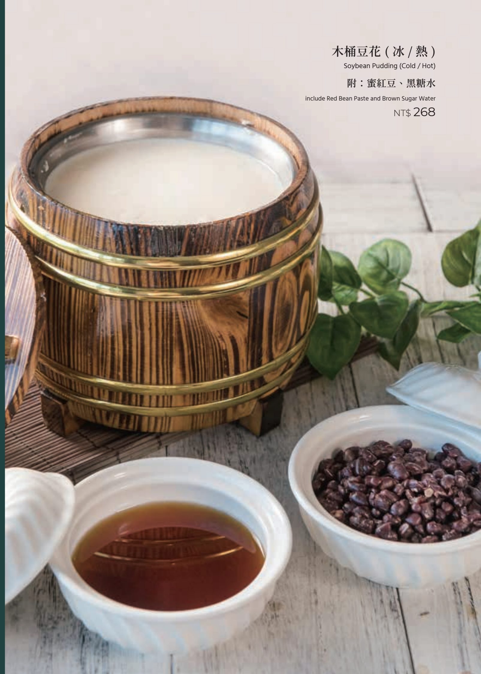
木桶豆花 (冰 / 熱)